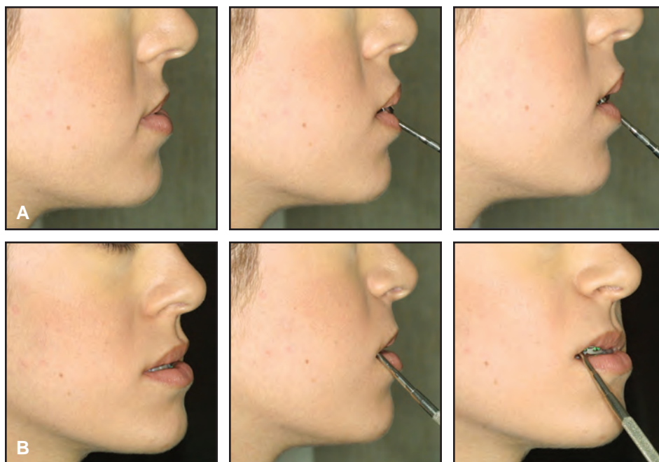
Fig. 4 A. Dental mirror advancement test, upper lip: dental mirror is held behind upper lip and pulled forward until desired support or esthetic change is achieved. Distance from front of mirror to central incisor labial surface equals required amount of anteroposterior maxillary advancement. B. Dental mirror advancement test, nasal base: dental mirror is held at nasal base with face relaxed; mirror is then pulled forward into nasal base until esthetic fullness is produced. Distance from front of mirror to mucosa over bone equals required esthetic advancement of maxillary surgery at nasal base.