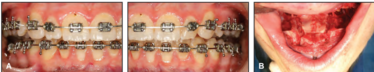
Fig. 1 A. Hanging posterior maxillary lingual cusp tips produced with presurgical orthodontic arch development and excessive labial crown torque. Multisegment maxillary surgery was required to upright posterior segments and establish occlusion. B. Photograph of nasal floor during surgery shows 8mm of expansion at osteotomy level and 0mm of expansion at dental level, resulting in unesthetic advancement of nasal base.